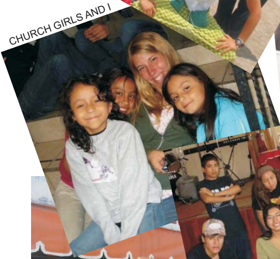
CHURCH GIRLS AND I