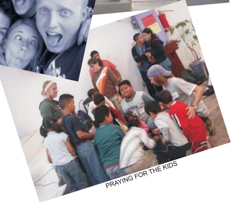
PRAYING FOR THE KIDS